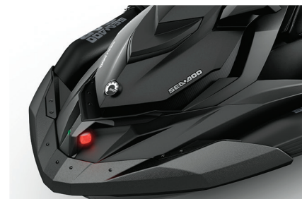
HEAVY-DUTY FRONT BUMPER