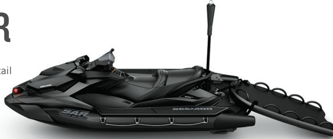
Rescue Sled Optional, sold separately

When you're on a rescue mission, every detail counts. The all-new Sea-Doo® Search and Rescue (SAR) watercraft seamlessly combines the features you need to respond to life threatening situations. It is designed for breathtaking rescue performances, from surf and white water, to flood and other emergency situations. The Sea-Doo SAR excels in rescue missions but is also ideal for evacuation, surveillance and interception. The SAR watercraft truly goes the extra mile. Because when lives are hanging in the balance, every detail counts.