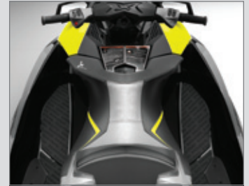
ALL-NEW Ergolock system