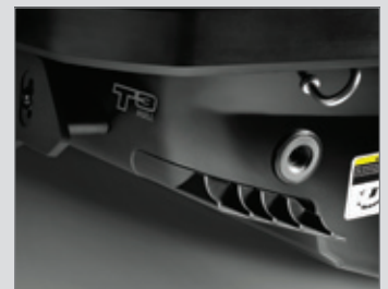
ALL-NEW Trim tabs