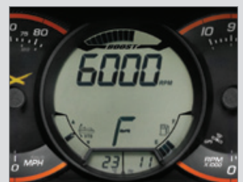
ALL-NEW X-Gauge with boost indicator

Introducing the best handling, performance-oriented watercraft on the market. With its Rotax® race-proven, muscle engine and the revolutionary new T³ Hull™ for more traction on the water, it gives the rider all the advantages. The new Ergolock™ system, includes a narrow racing seat, adjustable handlebars and angled footwells that have been tweaked to minimize upper body fatigue and provide more leverage. Add on the adjustable sponsons and trim tabs, and you'll have all the advantages to leave everyone behind on a buoy course.