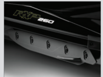
ALL-NEW Adjustable rear sponsons