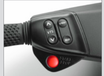
ECO™ and Sport mode controls