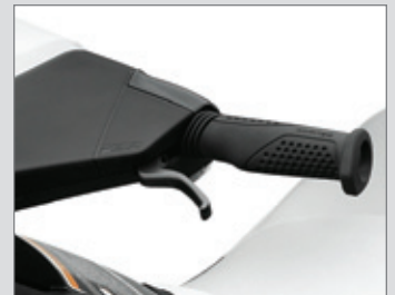
iBR™ (Intelligent Brake & Reverse)