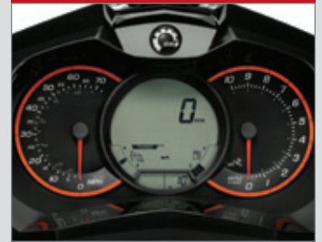
Driving Center including High-performance VTS™